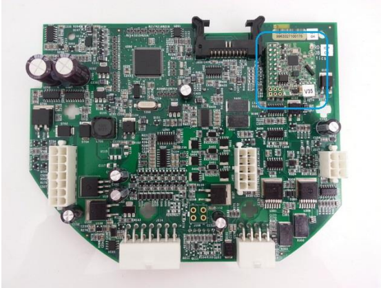
Figure 1 - C-platform Main Board